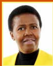
LINDIWE SIBANDA Vice President The Alliance for a Green Revolution in Africa Zimbabwe