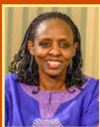
AGNES KALIBATA President The Alliance for a Green Revolution in Africa Rwanda