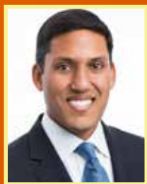
RAJIV SHAH President Rockefeller Foundation New York