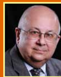
ISMAIL SERAGELDIN Director Library of Alexandria Egypt