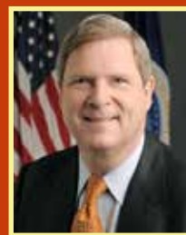
HON. TOM VILSACK President & CEO U.S. Dairy Export Council Washington, D.C.