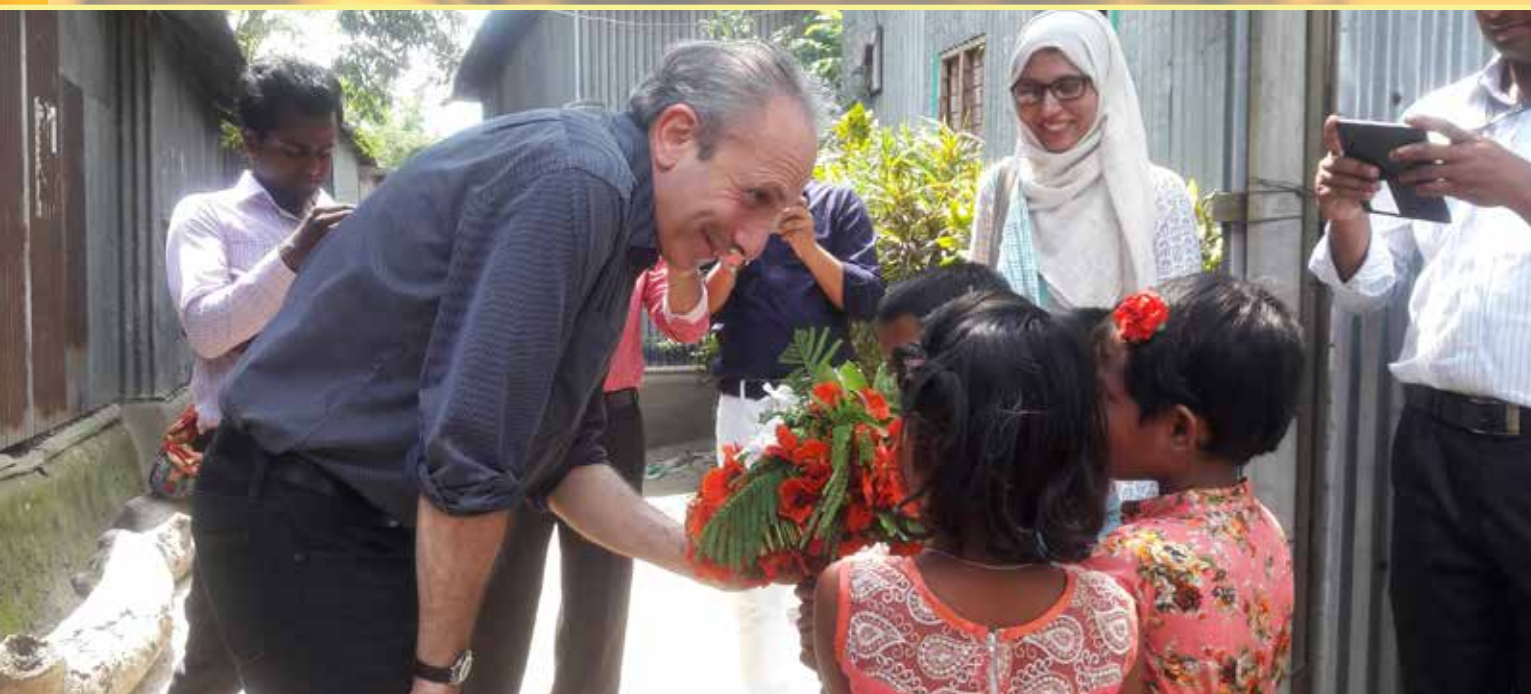
Lawrence Haddad in Bangladesh

Haddad's and Nabarro's work in mobilizing political will to make nutrition the focal point of development strategies came in response to a sudden, near doubling of wheat, maize and rice prices that occurred in 2007-2008.