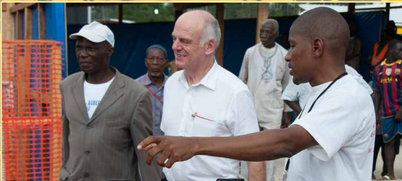
David Nabarro in West Africa

Haddad and Nabarro leapt into action, each rallying a broad and disparate group of food system stakeholders and development champions to rise to the challenge of prioritizing nutrition intervention policies and programs.