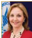
Josette Sheeran Executive Director, UN World Food Programme