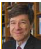
Jeffrey Sachs Director, The Earth Institute