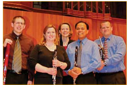
The Polaris Wind Quintet are playing tonight’s walk-in music.