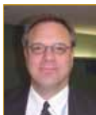
Roger Thurow Reporter, Wall Street Journal