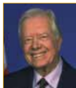
Hon. Jimmy Carter Atlanta, Georgia