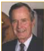
Hon. George Bush Houston, Texas