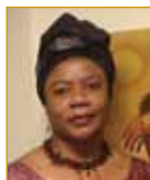
Faida Mitifu Ambassador to the United States, Democratic Republic of Congo