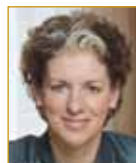
H.E. Gerda Verburg Minister of Agriculture, The Netherlands