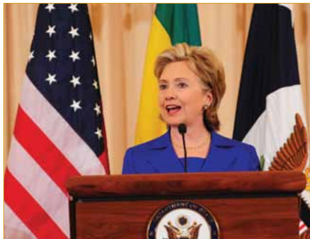
Secretary of State Hillary Rodham Clinton paid tribute to 2009 World Food Prize Laureate Gebisa Ejeta and laid out the Obama administration’s approach to global agriculture.

“Dr. Borlaug established the World Food Prize to keep our attention focused on the ongoing hunger crisis and on those whose work is significantly contributing to its end,” said Clinton.