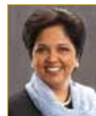
Indra Nooyi Chairman and CEO, PepsiCo