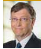
Bill Gates Co-Chair, The Bill & Melinda Gates Foundation