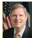
Tom Vilsack Secretary, Department of Agriculture