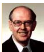
Hon. M. Peter McPherson President, APLU Washington, D.C.