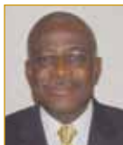
Kanayo Nwanze President, Intl. Fund for Agricultural Development