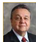
H.E. Roberto Rodrigues Former Minister of Agriculture, Brazil