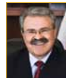
Gerry Ritz Minister of Agriculture, Canada