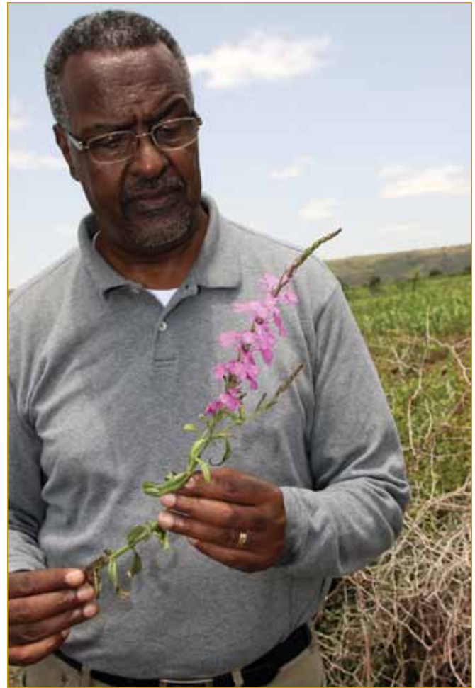
Dr. Ejeta inspects the Striga weed that causes massive crop damage throughout Africa, often decimating farmers' entire fields.

Ejeta's high academic standing earned him financial assistance and entrance to the secondary-level Jimma Agricultural and Technical School, which had been established by Oklahoma State University under the U.S. government's Point Four Program. After graduating with distinction, Ejeta entered Alemaya College (also established by OSU and supported by the U.S. Agency for International Development) in eastern Ethiopia. He received his bachelor's degree in plant science in 1973.