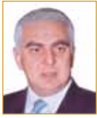
Amin Abaza Minister of Agriculture, Egypt