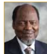
H.E. Joaquim Chissano Mozambique