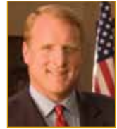
Hon. Chester Culver Governor, the State of Iowa