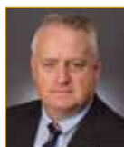
Richard Williamson Former U.S. Special Envoy for Sudan