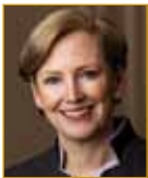
Ellen Kullman CEO, DuPont