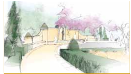
Artist renderings of the Laureate Lounge and exterior gardens.