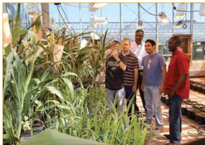
A graduate of the university, Dr. Ejeta has been on the Purdue faculty since 1984.

In 2002-2003, Dr. Ejeta introduced an integrated Striga management (ISM) package, again through a pilot program funded by USAID, to deploy in Eritrea, Ethiopia, and Tanzania along with the Striga-resistant sorghum varieties he and his colleagues had developed at Purdue. This ISM package achieved further increased crop productivity through a synergistic combination of weed resistance in the host plant, soil-fertility enhancement, and water conservation.