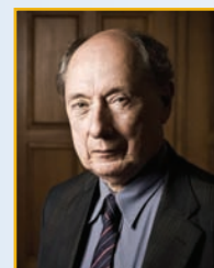
MARC VAN MONTAGU Professor Emeritus Institute of Plant Biotechnology for Developing Countries, Ghent University