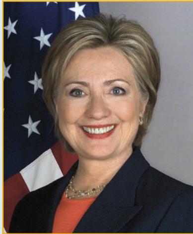
HON. HILLARY CLINTON U.S. Secretary of State