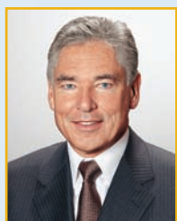
PETER BRABECK-LETMATHE Chairman of the Board of Directors Nestlé