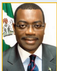
H.E. AKIN ADESINA Minister of Agriculture Nigeria