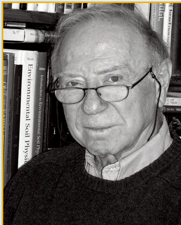
DR. DANIEL HILLEL ISRAEL

Dr. Hillel has worked in more than 30 countries and his irrigation technology is now used to produce nutritious food on more than 6 million hectares worldwide, impacting millions of people.