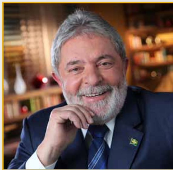
H.E. LUIZ INÁCIO LULA DA SILVA BRAZIL

Former Presidents John Agyekum Kufuor and Luiz Inácio Lula da Silva have been chosen to jointly receive the 2011 World Food Prize for their personal commitment and visionary leadership while serving as the presidents of Ghana and of Brazil, respectively, in creating and implementing government policies to alleviate hunger and poverty in their countries.