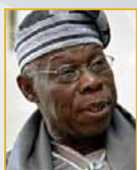
OLESUGUN OBASANJO Former President Nigeria