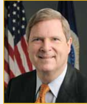
HON. TOM VILSACK U.S. Secretary of Agriculture