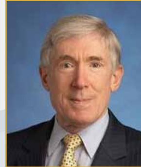
HON. ROBERT HORMATS U.S. Undersecretary of Economic, Energy and Agricultural Affairs