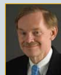
ROBERT ZOELICK President The World Bank