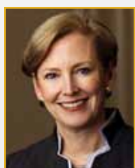
ELLEN KULLMAN President, Chairwoman and CEO, DuPont