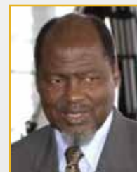
JOAQUIM CHISSANO Former President Mozambique