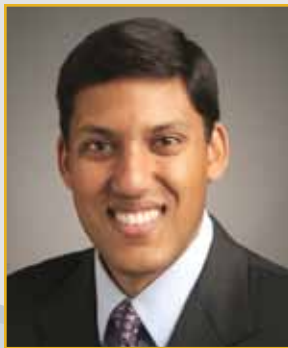
HON. RAJIV SHAH USAID Administrator