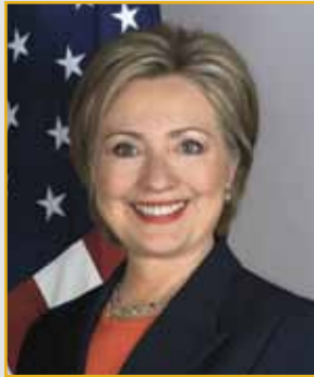
HON. HILLARY CLINTON U.S. Secretary of State