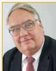
HOWARD G. BUFFETT President Howard G. Buffett Foundation