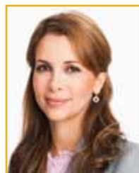
HRH PRINCESS HAYA AL HUSSEIN UN Messenger of Peace