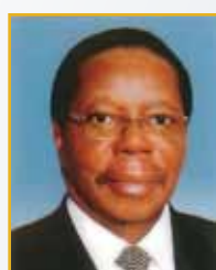
BINGU WA MUTHARIKA President Malawi