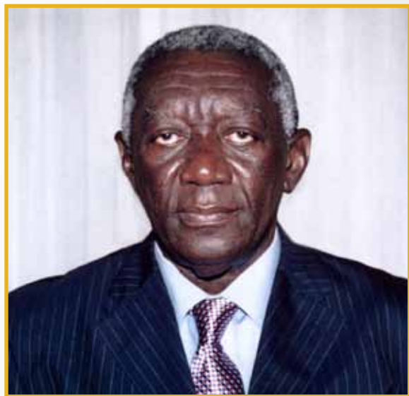
H.E. JOHN AGYEKUM KUFUOR GHANA