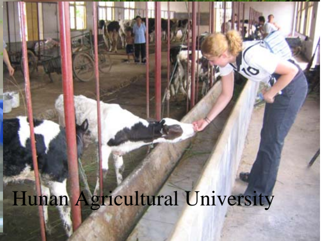
Hunan Agricultural University