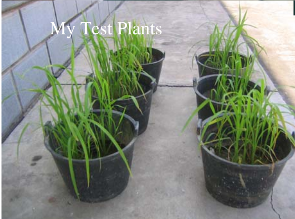
My Test Plants