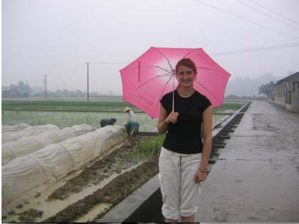
My First Day in Changsha