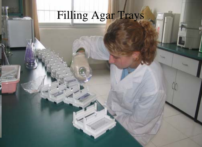
Filling Agar Trays