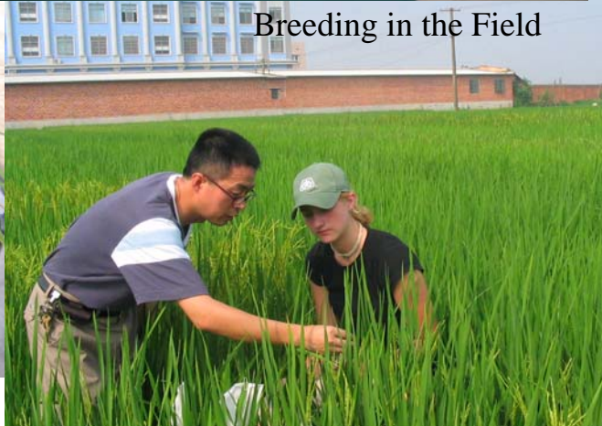
Breeding in the Field