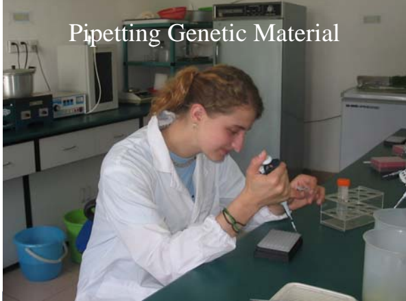
Pipetting Genetic Material