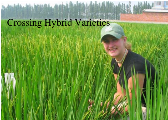
Crossing Hybrid Varieties