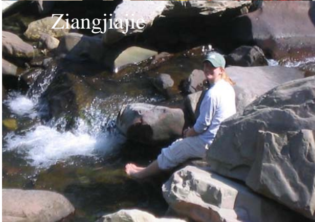
High School Friends