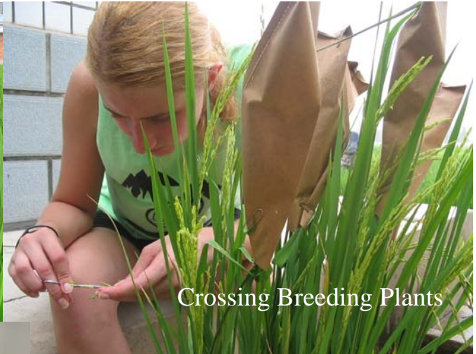
Crossing Breeding Plants