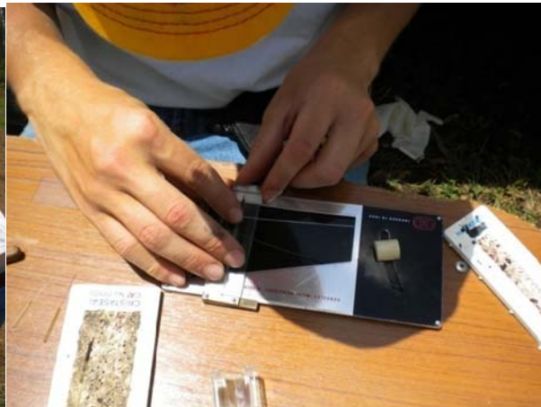
Figure 0-2 Taking PCV level