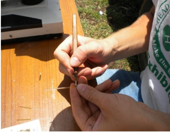
Figure 0-3 Cutting Capillary tube with diamond pencil