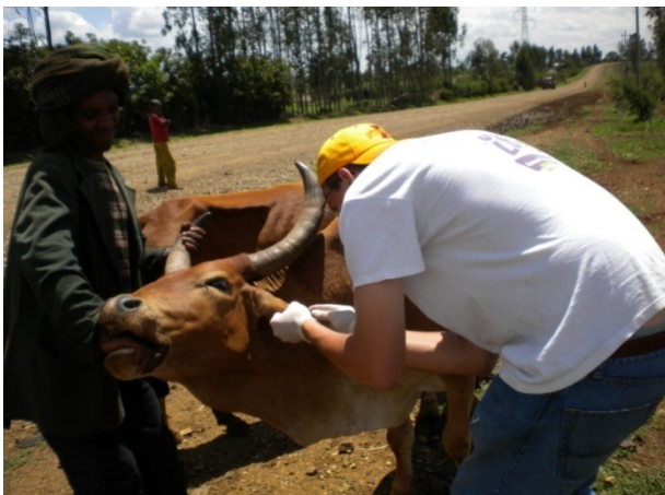
Figure 0-1 Drawing Ear vein blood