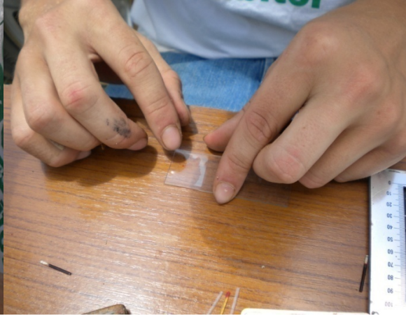
Figure 0-4 Preparing wet slide