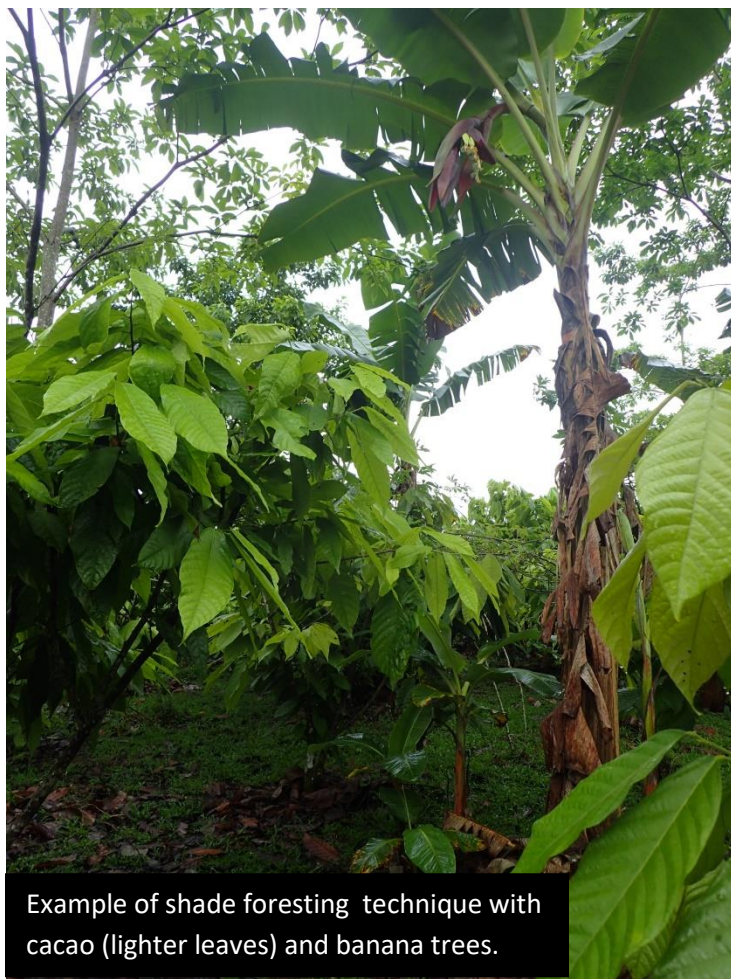
Example of shade foresting technique with cacao (lighter leaves) and banana trees.