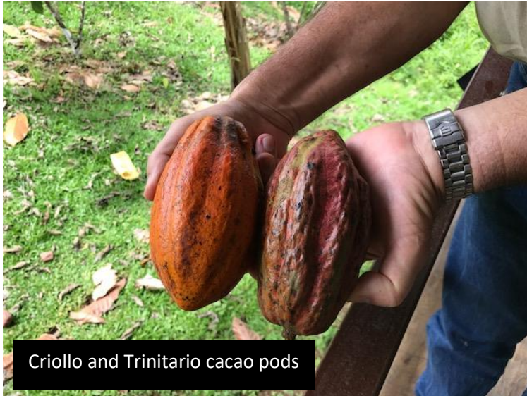
Criollo and Trinitario cacao pods