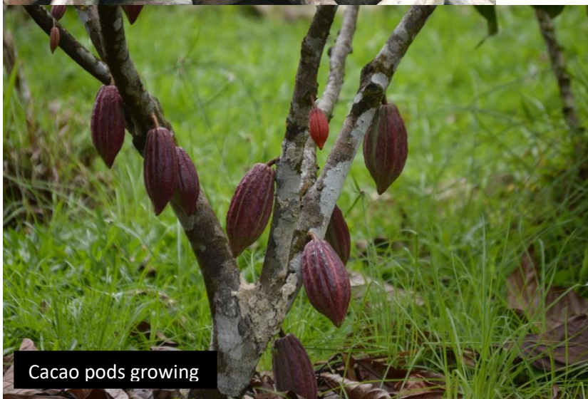
Cacao pods growing