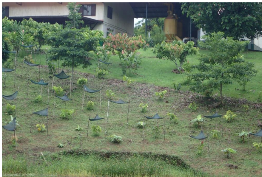
Cacao nursery- effort to repopulate with resistant cultivars of cacao