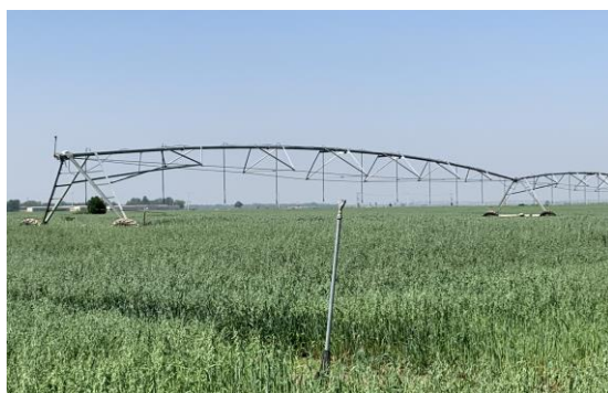
self-traveling rotating sprinklers with traditional upright irrigation

In the field survey, the author noted that the benefits of water-saving spray irrigation in the pasture planting park of Aihe Group in Weixian County of Xingtai is quite satisfying. Aihe Group is the upstream enterprise of Junlebao Dairy which mainly provides grass and flowers that are needed by Junlebao's meadow. The pasture planting area focuses on self-traveling rotating sprinklers with traditional upright irrigation as the auxiliary (which are shown in the figure). While working, self-traveling rotating sprinklers will rotate around the axis of its central part, and each irrigation may cover 300 mu of land. Corners that cannot be covered will be irrigated in the form of upright spray irrigation.