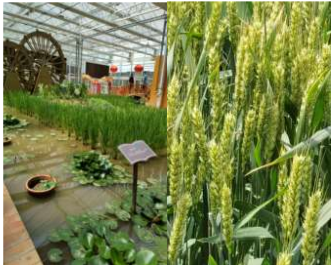
Fig2:symbiotic planting of fish and vegetables