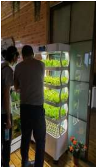
Fig1 :three-dimensional soilless cultivation of plants

development of the green agricultural industrial chain. Zhengding TaYuanzhuang also deepens and expands projects such as three-dimensional soilless cultivation of plants(Fig1) and symbiotic planting of fish and vegetables(Fig2), builds a modern agricultural science and Technology Industrial Park with green agriculture as its characteristics, and realizes the simultaneous development of culture, tourism, research and learning with research and learning tourism, leisure and entertainment, rural scenery and so on. On this basis, Zhengding TaYuanzhuang actively builds a new health and elderly care service mode, so that industrial development can benefit people's livelihood more, and truly realizes the integrated development of primary, secondary and tertiary industries under the development of green agricultural industrial chain based on green agriculture.