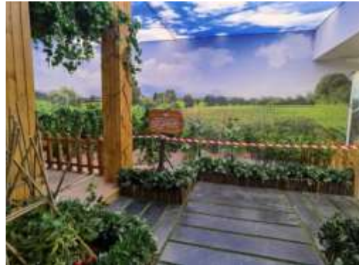
Fig4:the model of rural health care for the seniors

The Rural Revitalization model of TaYuanzhuang Tongfu(Fig5) closely focuses on the development of modern agriculture and the integrated development of rural primary, secondary and tertiary industries to build a rural industrial system. It integrates R & D, production, sales, Internet, logistics and services, and integrates primary, secondary and tertiary industries. In the past three years, it has introduced more than 100 talents, created more than 10000 jobs, trained more than 10000 high-quality farmers, provided more than 3000 nursing beds, and received 2million tourists a year, truly realizing industrial prosperity and Rural Revitalization.